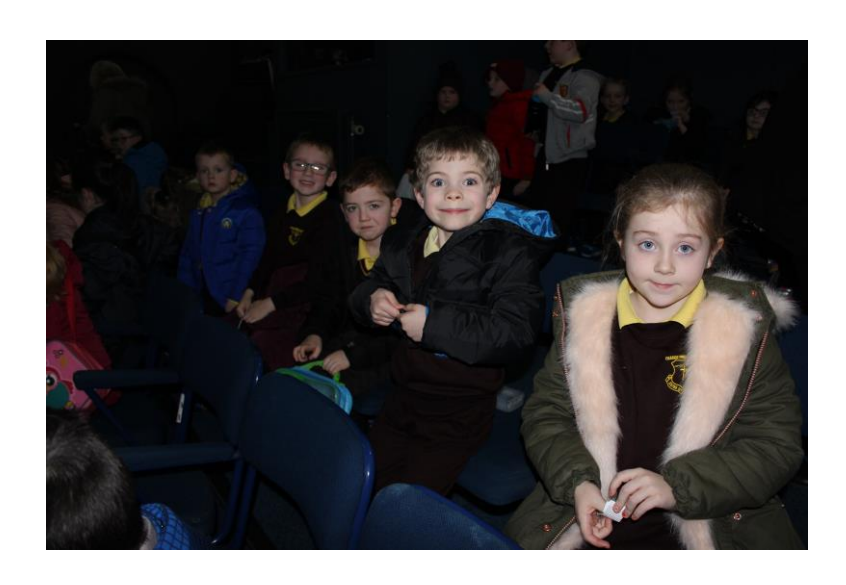
Primary 1-3 thoroughly enjoyed their visit to Newry City Hall to see 'Snow White' on Thursday. "Oh yes they did!!"

Email: info@grange.kilkeel.ni.sch.uk www.grangeprimaryschoolkilkeel.co.uk